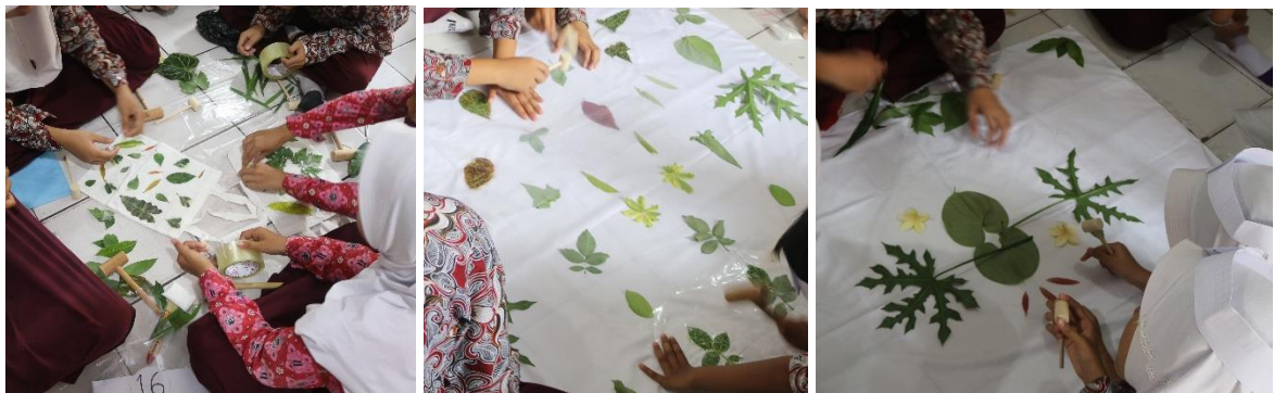
Figure 2. Students carried out an ecoprint product creation project with their group members

Students then carried out an ecoprint product creation project with their group members (Figure 2). During the project, students collaborated to achieve a common goal: producing an ecoprint product. Collaboration enables individuals and groups to work together to achieve a common goal through the exchange of ideas, shared use of resources, and equitable sharing of responsibilities .