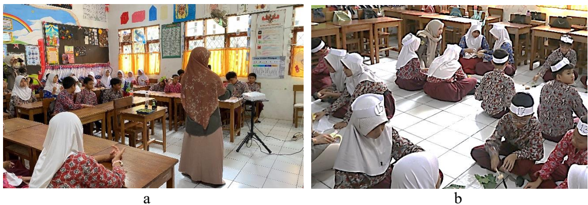
Figure 1. Students listen to the teacher's delivery of basic questions (1a). Students discuss the project design and project implementation schedule (1b).

The STEAM Ecoprint-integrated PjBL model was implemented at Cipocok Jaya Public Elementary School, Serang City. The PjBL model began with the teacher presenting a basic problem-solving question related to the environmental hazards of clothing dye waste (Figure 1a). In the next stage, students created a project design that included objectives and implementation stages. Students then discussed and developed a project schedule or timeline. STEAM (Science, Technology, Engineering, Art, and Mathematics) components were incorporated into the ecoprint project materials and activities to ensure innovative and interdisciplinary learning, while also providing students with opportunities to optimally develop their collaborative skills.