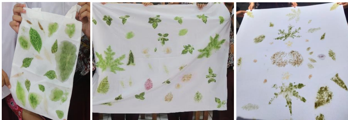
Figure 3. Students display the Ecoprint products they have produced.

The final products of the STEAM Ecoprint-integrated PjBL phase were a tote bag and a tablecloth with leaf motifs from various plant species (Figure 3).