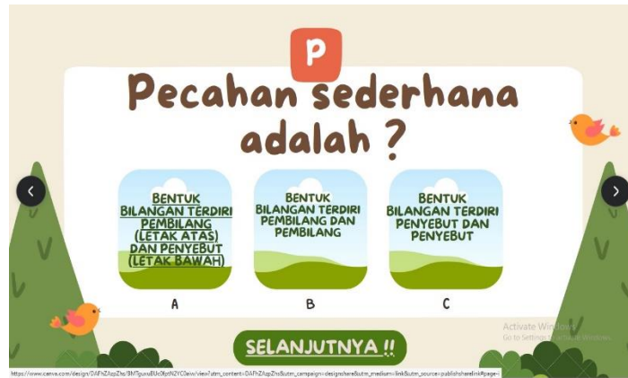
Figure 3. Design Quiz Play

Quiz played: There is a choice of 7 numbers which contain questions about mathematics lessons, simple fraction introduction material for third grade elementary school students.