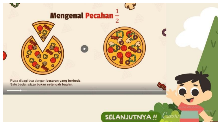
Figure 2. Introduction to Quiz Fractions

Media Quiz Creating product in a play is adjusted to the available tools and according to the desired display needs.