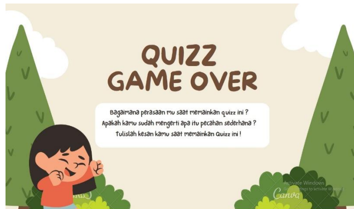
Figure 4. Final Quiz Design

Quiz played: There is a choice of 7 numbers which contain questions about mathematics lessons, simple fraction introduction material for third grade elementary school students.